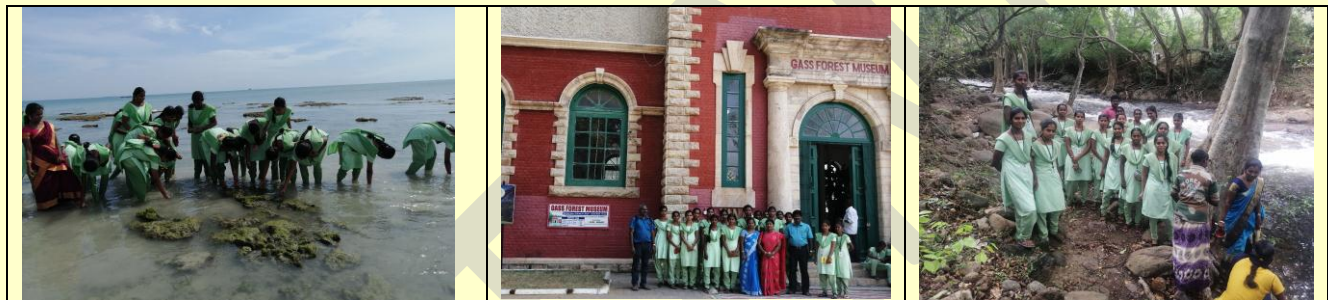
On 03 – 09- 2019 – I M. Sc. Botany students went for educational tour to Tuticorin coast for the Algal Collection.