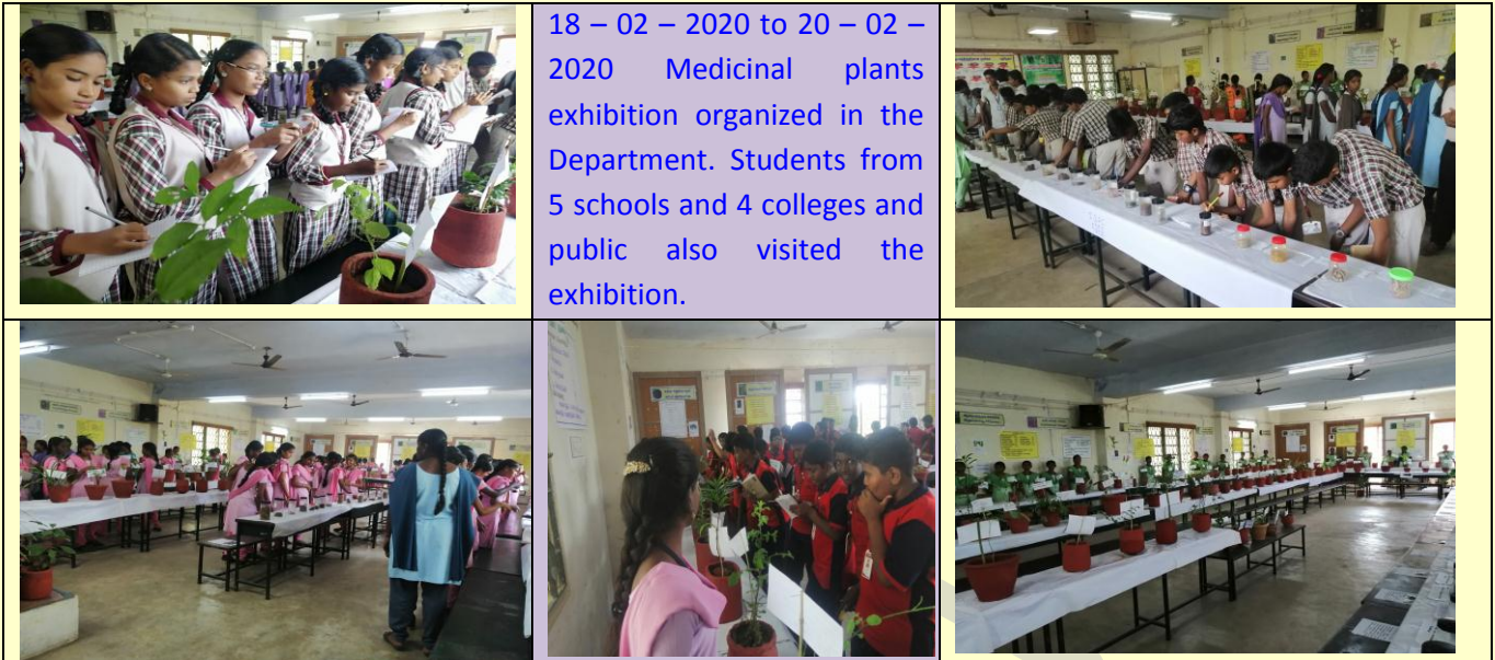
18 – 02 – 2020 to 20 – 02 – 2020 Medicinal plants exhibition organized in the Department. Students from 5 schools and 4 colleges and public also visited the exhibition.