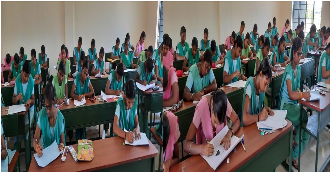
Competition for the students : Slogan, Essay writing, Elocution, Poster