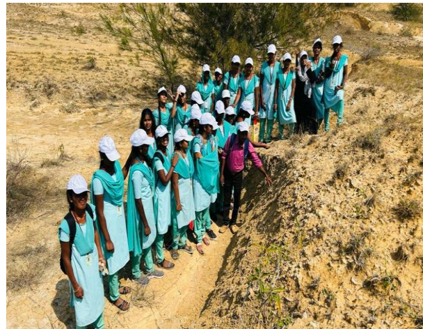
Upper Gondwana clay mining at Karai near Ariyalur & Fossil (Belemnites) collection on Badland Topography at Karai near Ariyalur