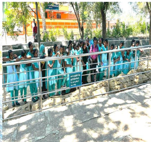
Wood fossil (20 million years old) at Sathanur near Ariyalur