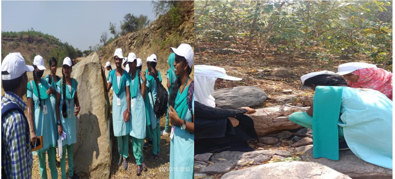
Dunite rock near Salem & Sample collection at Kanjamalai, Salem