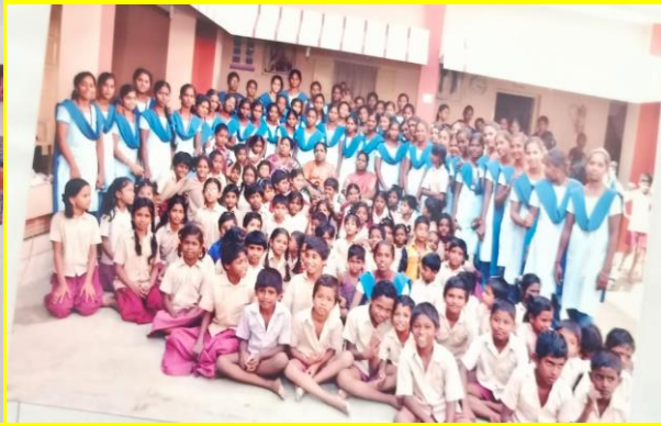
VENUE : JOY BHAVAN ORPHANAGE, C.I.C CONVENT, N.G.O.B' COLONY.