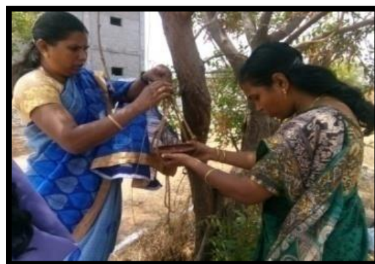
Hanging water Pots on Trees