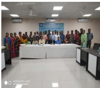
FDP Programme, Nagpur