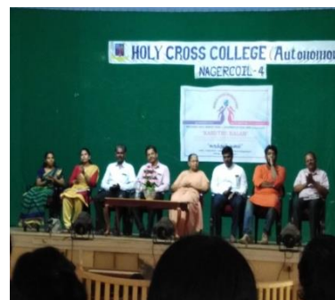
Social Workers Day Celebration