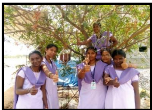
Birds Conservation Activity

Giving Water to birds is very important during summer when natural supplies are dried. They feel very hard to find water due to hot weather. So our Social Work department has initiated the activity of hanging water pot on the trees. Students are daily filling water and monitoring also. This programme creates awareness on the need of Environment protection among the students.