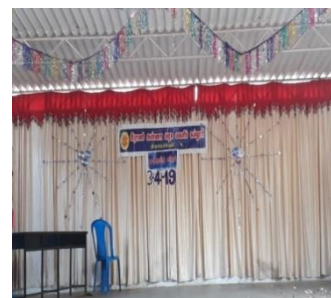
Fine Arts day & Muthamizhl Vizha