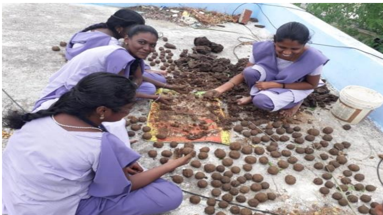
Making Seed Balls

The students produced seed balls to promote awareness on tree conservation on WORLD NATURE CONSERVATION DAY. Using cow dung, clay and dried seeds of neem, mango, jamun, Indian beech, teek, Indian almond and water are mixed together and made into balls. The awareness among students was done through puppetry. These balls were distributed to the school students and instructed to throw it in the air. When rain falls on the earth it starts to germinate