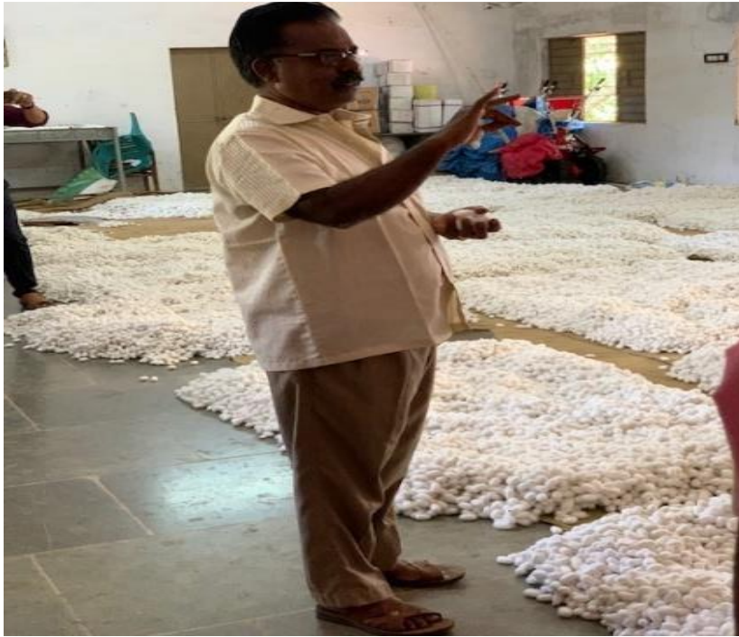
23.02.2023 Apiculture centre Cholaiseri, Tenkasi